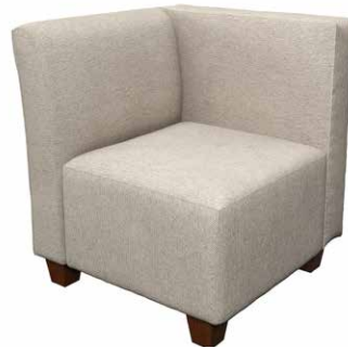
Bartlesville Left Straight Arm One Arm Chair