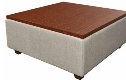
Bartlesville 28" Laminate Ottoman