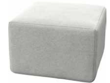
Bartlesville 23" Side Table