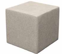
Bartlesville 18" Side Table