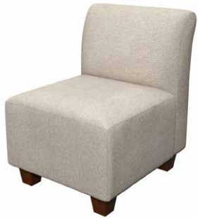
Bartlesville Armless Chair