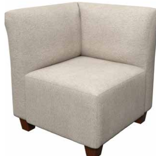
Bartlesville Corner Chair with Curved Arm