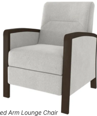
Closed Arm Lounge Chair