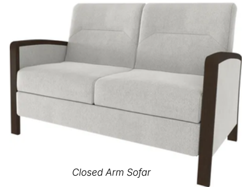
Closed Arm Sofa