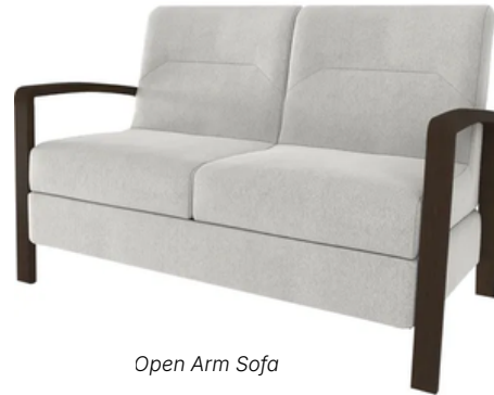
Open Arm Sofa