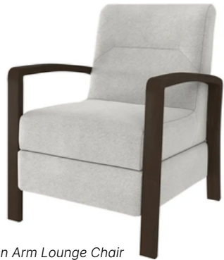
Open Arm Lounge Chair